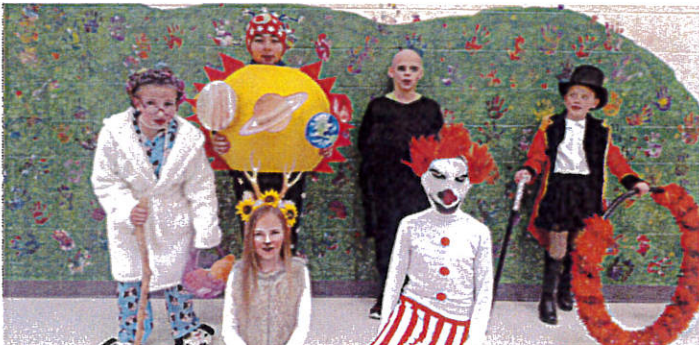
3-5 Halloween Costume Winners