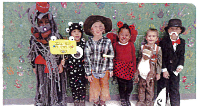
K-2 Halloween Costume Winners